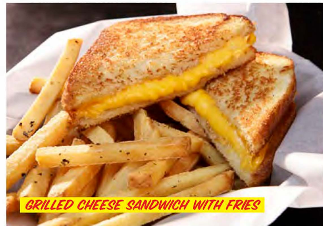
GRILLED CHEESE SANDWICH WITH FRIES