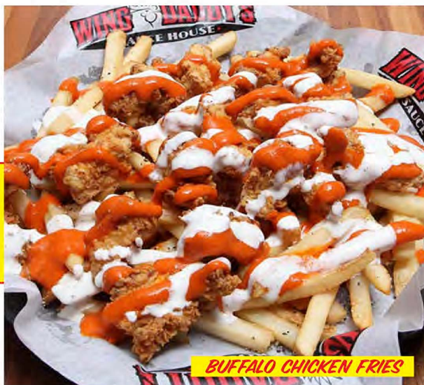
BUFFALO CHICKEN FRIES

-A HEAP OF OUR SEASONED FRIES, TOPPED WITH CRISPY CHICKEN, TANGY BUFFALO SAUCE, AND HOMEMADE RANCH. CHANGE IT UP!! REQUEST YOUR FAVORITE SAUCE.