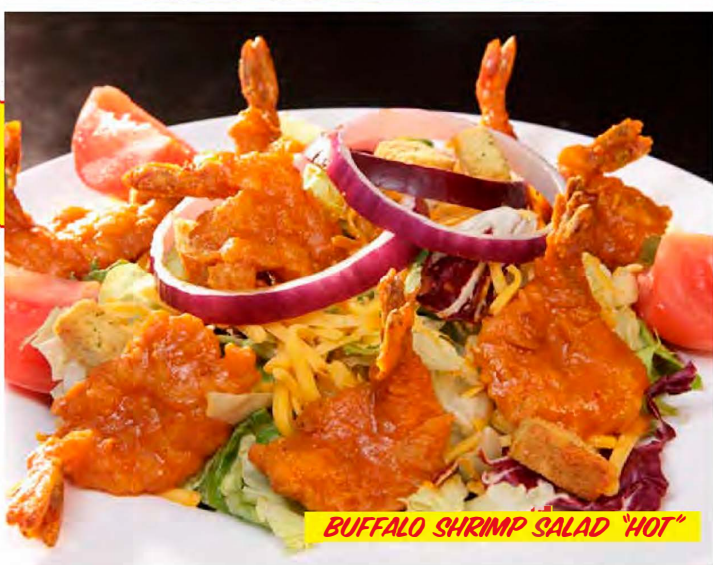
BUFFALO SHRIMP SALAD "HOT"