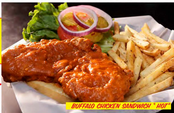
BUFFALO CHICKEN SANDWICH "HOT"