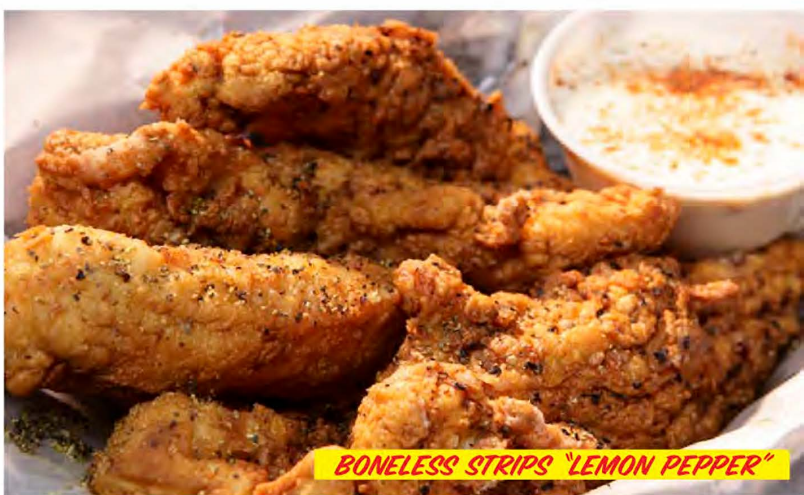
BONELESS STRIPS "LEMON PEPPER"