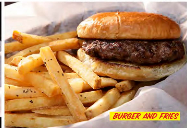
BURGER AND FRIES