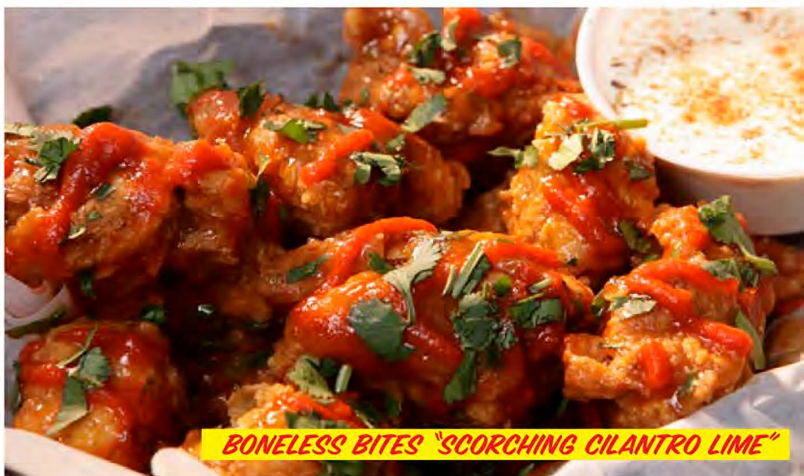
BONELESS BITES "SCORCHING CILANTRO LIME"