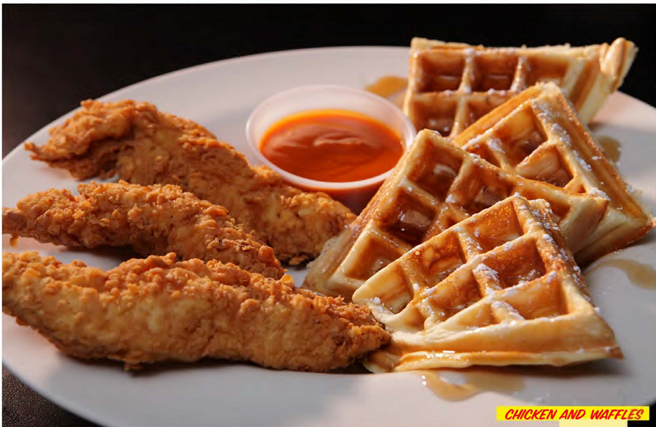
CHICKEN AND WAFFLES