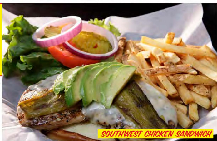
SOUTHWEST CHICKEN SANDWICH