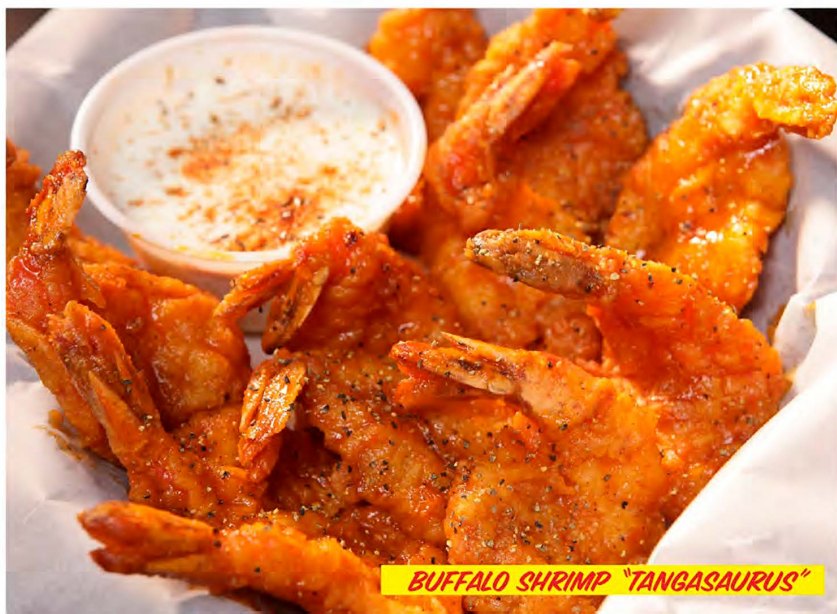
BUFFALO SHRIMP "TANGASAURUS"

FIVE SAUCE SMOTHERED SLABS, FRIES, AND COLESLAW