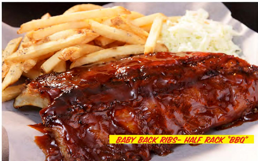
BABY BACK RIBS- HALF RACK "BBQ"

TENDER, TASTY AND TOP SECRET! OUR SAVORY, FALL OFF THE BONE RIBS ARE DOUSED IN OUR ULTRA TOP SECRET BBQ SAUCE...SO SECRET WE BLINDFOLD OUR COOKS! ALSO AVAILABLE WITH OUR OTHER SAUCY TEMPTATIONS: HONEY HOT, FLAMIN' BBQ, AND HONEY BBQ. -SERVED WITH 2 OF THE FOLLOWING: POTATO SALAD, COLESLAW, OR FRIES.