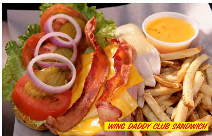
WING DADDY CLUB SANDWICH