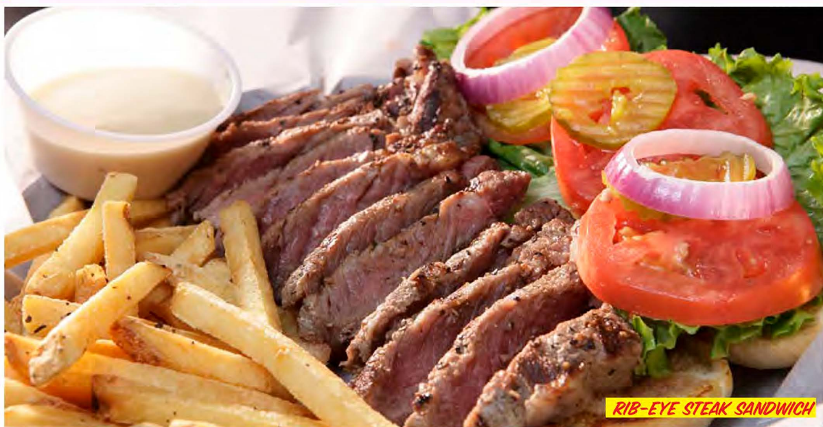
RIB-EYE STEAK SANDWICH

-THE STEAK SANDWICH OF YOUR DREAMS! BITE INTO OUR JUICY RIB-EYE PREPARED TO YOUR SPECS. SERVED WITH OUR DJJON HORSERADISH SAUCE. 🍷