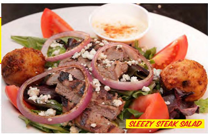
SLEEZY STEAK SALAD

SIDE SALAD..... -A SMALLER VERSION OF OUR LARGER SALADS WHICH INCLUDES CARROT STRINGS, CABBAGE, RED ONION AND TOMATO WEDGES.